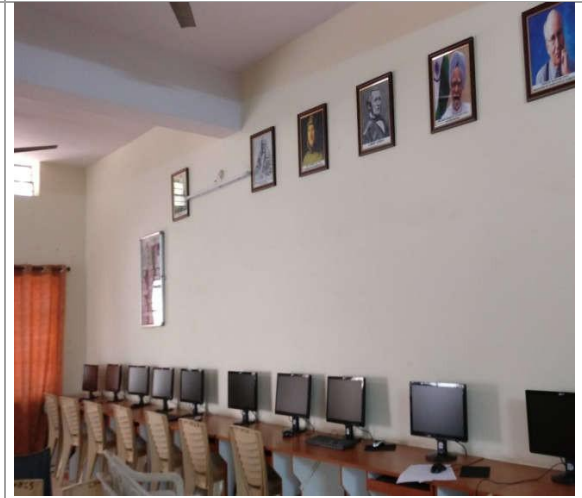
B Com Lab